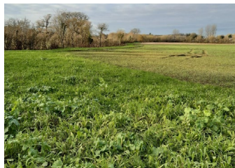
Buffer strip reducing soil erosion to nearby watercourse