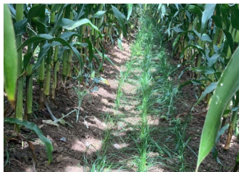
Undersown grass establishing under maize canopy