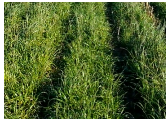
Undersown grass providing winter ground cover post maize harvest