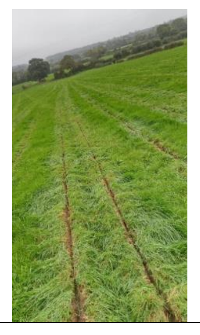
Example of grassland subsoiling funded by the Phosphorus Reduction Scheme