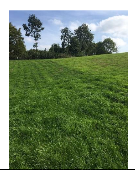
Grassland subsoiler used in West Dorset. Lifted area on left, unlifted area on right.