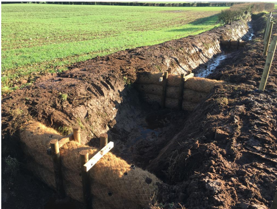
Coir-roll filter dam.

https://www.fwagsw.org.uk/Handlers/Download.ashx?IDMF=ee225b3a-8db3-4675-96c4-ab220cec3967