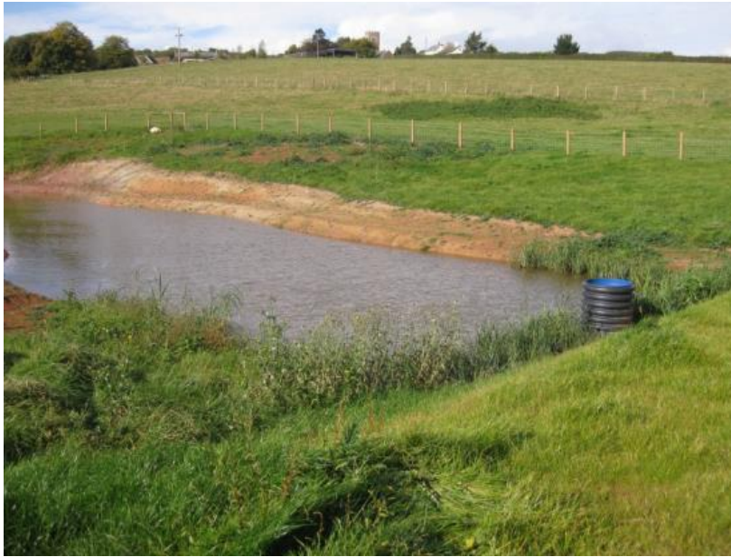
Sediment pond.

https://www.fwagsw.org.uk/Handlers/Download.ashx?IDMF=ee225b3a-8db3-4675-96c4-ab220cec3967