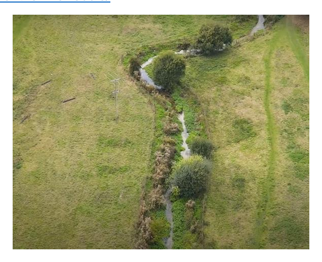
Fencing dairy cattle out of a stream: 10 years on.

Game and Wildlife Conservancy Trust film (with the longer-term benefits of watercourse fencing shown at approx 4 minutes in): <a href="https://www.gwct.org.uk/blogs/news/2022/november/gwct-video-farmer-led-conservation-of-the-river-ebble/">https://www.gwct.org.uk/blogs/news/2022/november/gwct-video-farmer-led-conservation-of-the-river-ebble/</a>