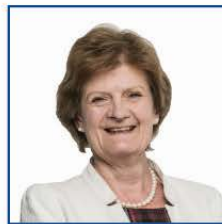
Dame Fiona Reynolds